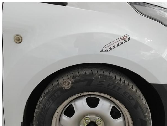
1: Wing of Dented Over 2 Up To 10mm