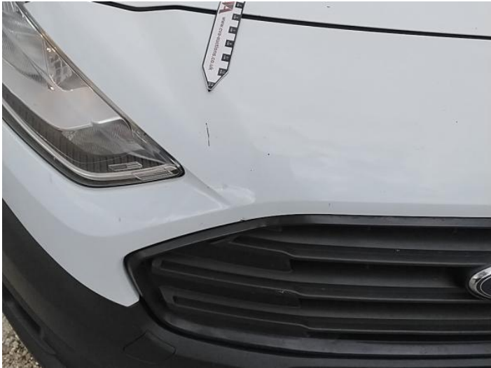
4: Panel Front Scratched UpTo 25mm Thru Paint