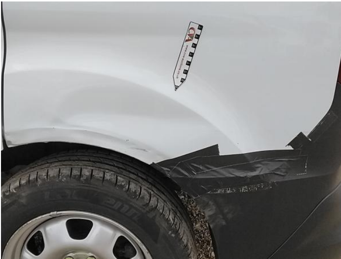
5: Qtr Panel nsr Dented Over 30% Of Panel