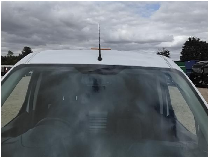
3: Screen Front Chipped UpTo 10mm