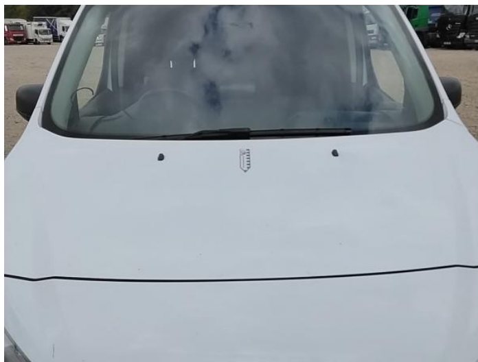
2: Bonnet Chipped Multiple Chips