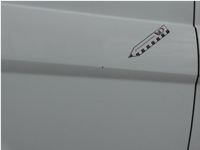
6: Qtr Panel osr Chipped 1 To 5